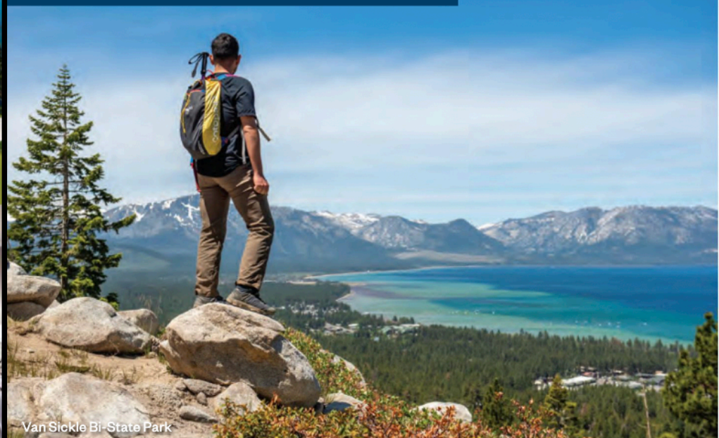
Van Sickle Bi-State Park