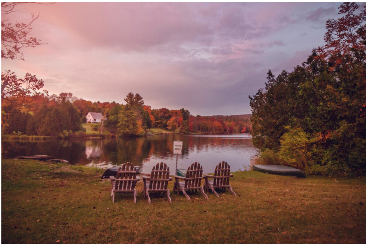
Twin Farms, Vermont

By: Abigail Pacheco | September 19, 2022 | Lifestyle