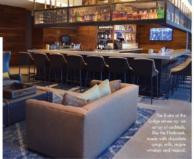
The Bistro at the Lodge serves up an array of cocktails, like the Firebreak, made with chocolate syrup, milk, maple whiskey and mezcal.